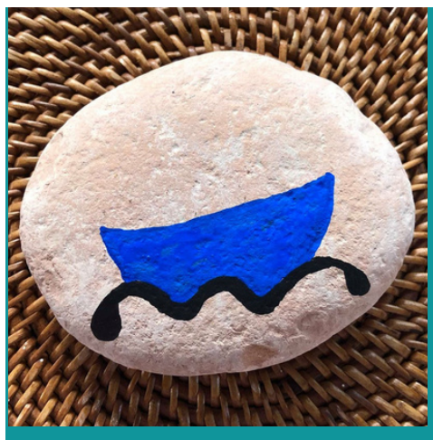
Paint a black wave - dry Colour in the boat base.

Paint in a layer at a time. If you do this technique make sure your colours dry before adding the next or they will bleed together.