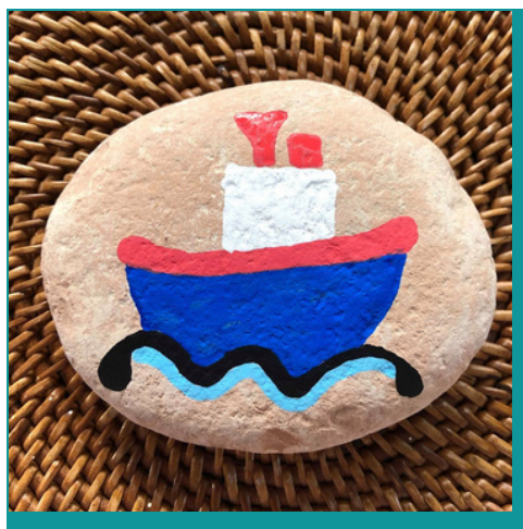
Now it is time to add some shapes to create the boat cabin. Using Posca brand pen regular colours of this brand red & white.