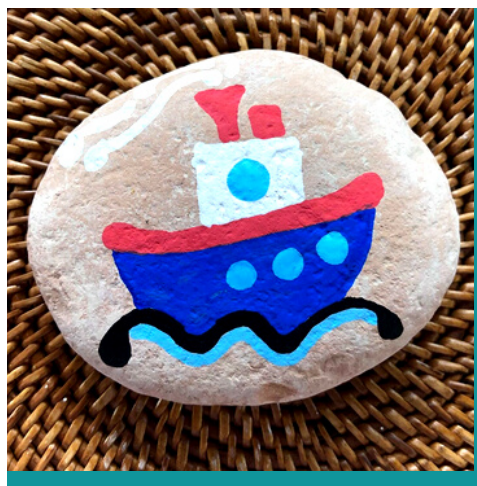
Add in some decorative simple features like the smoke and portholes.