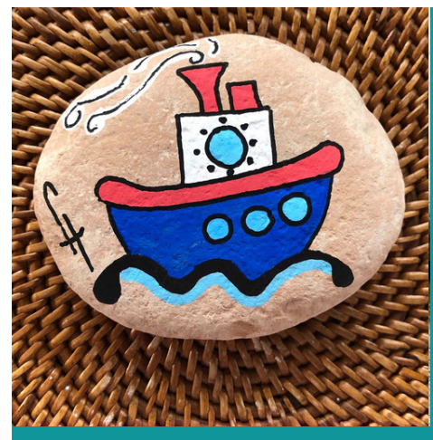
Take a 0.7mm black acrylic paint pen and outline your image giving some definition.

Are you looking for a great fine line pen Find some HERE