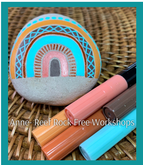
Anne- Reef Rock Free Workshops