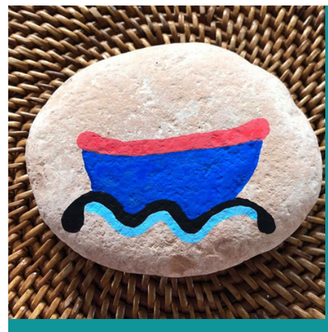
Add in the red top for the boat - let this dry It only takes a minute. and the blue into the wave